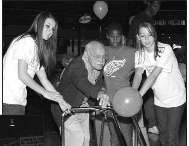
(Above) There was Bessie’s Hope intergenerational fun and excitement happening at two bowling centers, Monaco Lanes and FatCats.